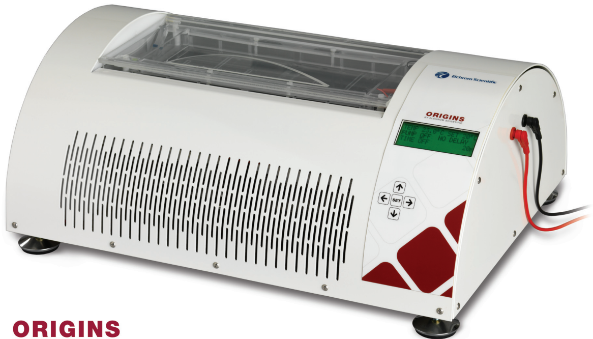
ORIGINS BY ELCHROM SCIENTIFIC

ORIGINS by Elchrom™ Scientific revolutionizes submarine electrophoresis for DNA/RNA analysis and purification.